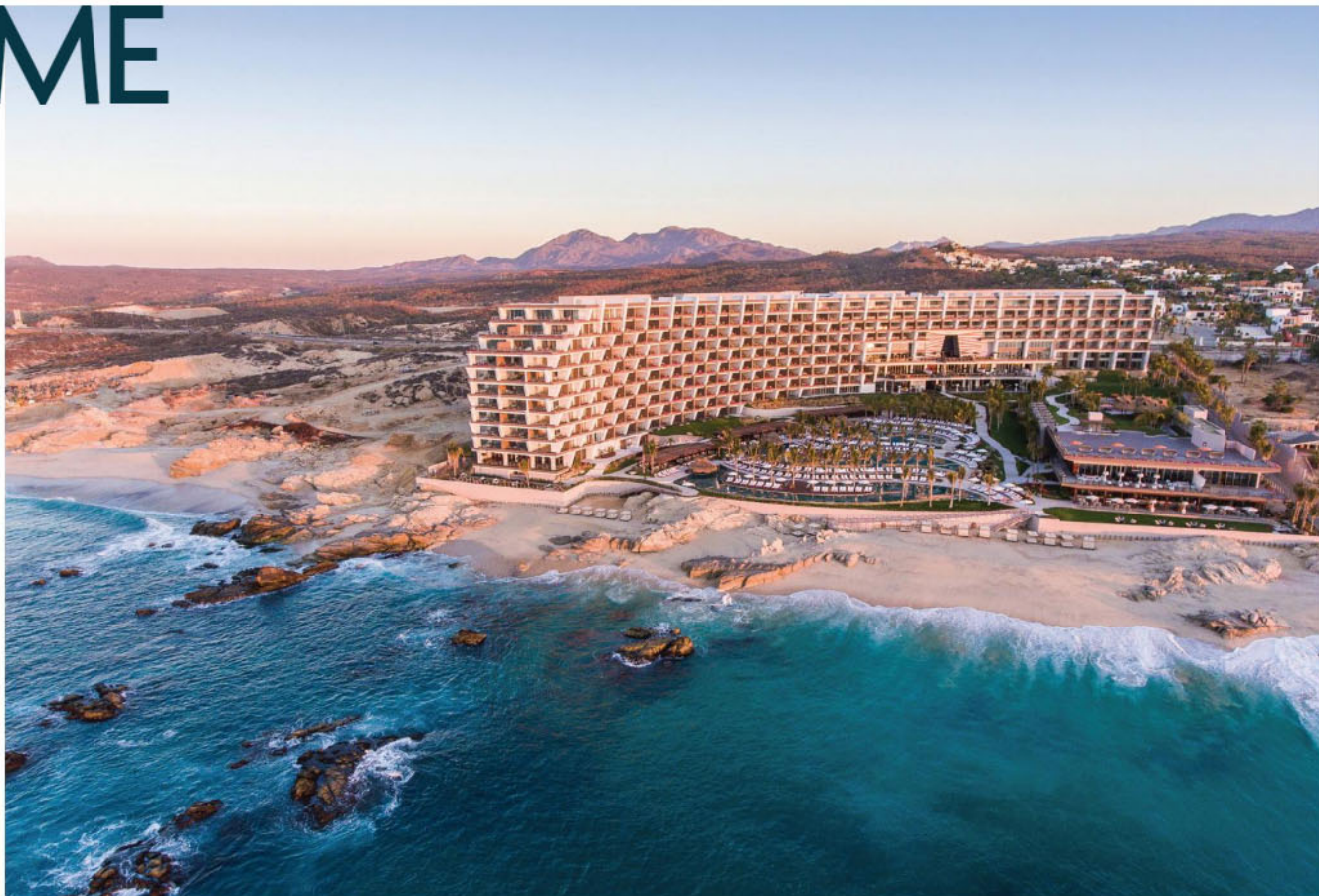
BAJA BEAUTY: Grand Velas' many charms start with a spectacular location right on the coast, where soft sand and sparkling ocean views beckon.