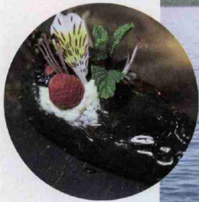
Caramelized poblano pepper at Frida, below; infinity pool at Grand Velas Riviera Nayarit, right